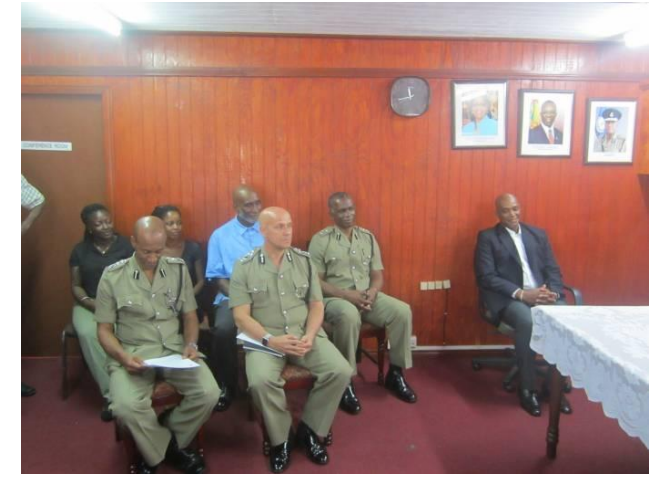
Specially invited guests and members of the Police Force at the ceremony